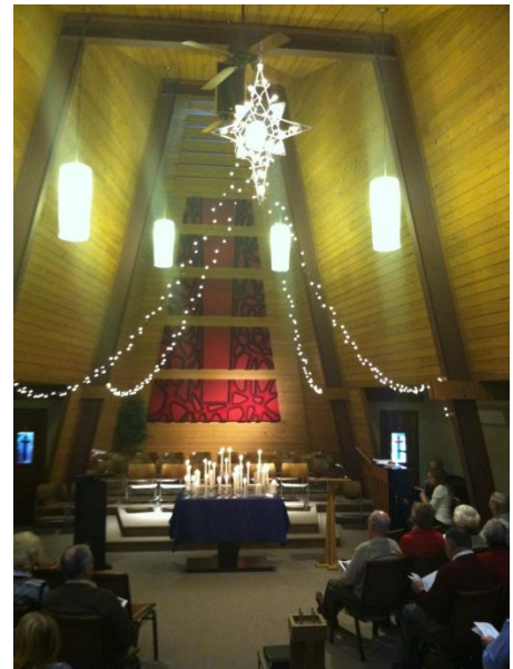
Carols & Candles