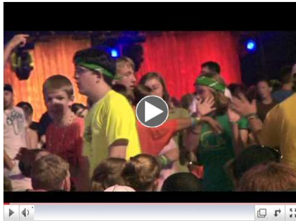
2012 ELCA Youth Gathering